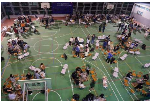
The Diamond Jubilee Home-coming Day for Alumni and Ex-teachers on 8 Jan 2023