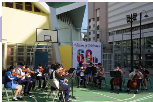
The F.1 Admission Talk cum Open Day on 12 Nov 2022