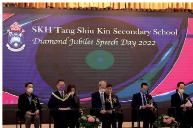
The Diamond Jubilee Speech Day on 13 Jan 2023