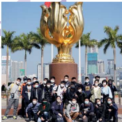
The Diamond Jubilee Walkathon from mid-January to late February 2023