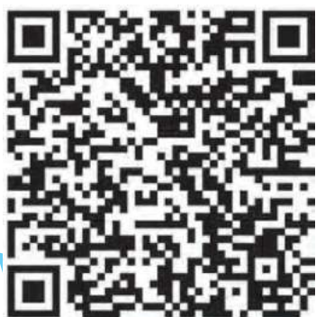
YouTube – TSK Recital Studio

One of the Recital Studio's key highlights is the high-quality recordings produced by our students. Under the guidance of professional instructors, our student production team have developed skills in recording and audio production. Their impressive performance has attracted invitations from esteemed organizations like the Chinese University Chorus and Alice Ho Miu Ling Nethersole Charity Foundation for recording projects.