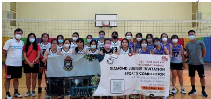
The Diamond Jubilee Invitation Sports Competition on 26 & 27 Jul 2022

To celebrate our school's 60th anniversary, various celebration events were organised.