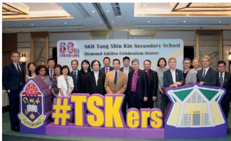
The Diamond Jubilee Celebration Dinner on 8 Jul 2023