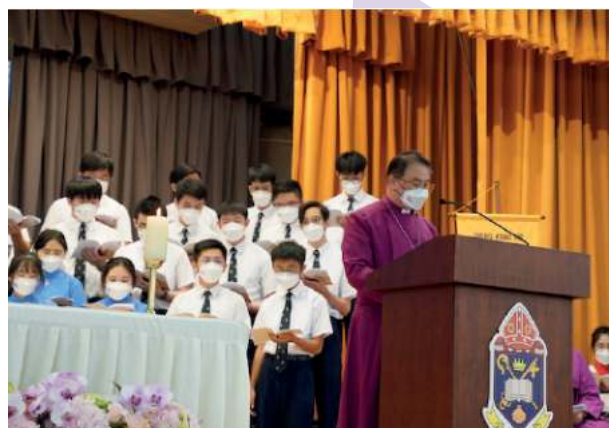
The Diamond Jubilee Thanksgiving Service on 15 Sep 2022