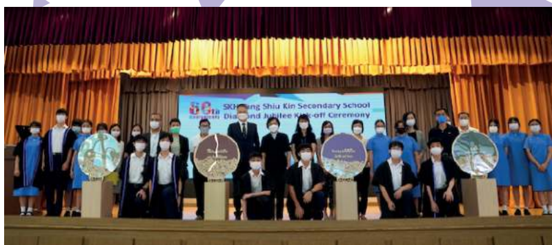
The End-of-Term Service cum Diamond Jubilee Kick-off Ceremony on 3 Aug 2022